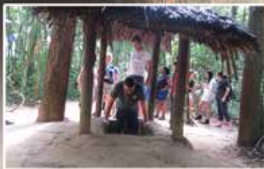
Tourists visit the tunnel