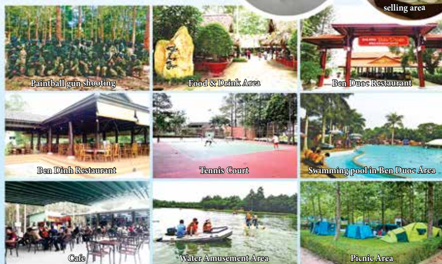
Paintball gun shooting