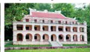
MODEL OF DRAGON WHARF (1/4 Scale)