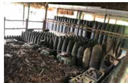
Display house of bombs and artillery

Located within Cu Chi Tunnels, Ben Duoc Tunnel is a base of Regional Party Committee and Saigon - Gia Dinh Military Command, with tunnel system, basements of the leaders of Regional Party Committee and Saigon - Gia Dinh Military Region used to live and fight during the war. This is a unique architecture with a system of tunnels deep in the ground, with many floors, many nooks and crannies like spider web, for the accommodation, meeting and fighting. Tunnel system showed the resilience, intelligence, and pride of Cu Chi's people, a symbol of revolutionary heroism of Vietnamese nation.