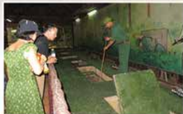
Tourists learn about types of self-made spike traps

Located within Cu Chi Tunnels, Ben Duoc Tunnel is a base of Regional Party Committee and Saigon - Gia Dinh Military Command, with tunnel system, basements of the leaders of Regional Party Committee and Saigon - Gia Dinh Military Region used to live and fight during the war. This is a unique architecture with a system of tunnels deep in the ground, with many floors, many nooks and crannies like spider web, for the accommodation, meeting and fighting. Tunnel system showed the resilience, intelligence, and pride of Cu Chi's people, a symbol of revolutionary heroism of Vietnamese nation.