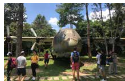
C-130 transport aircraft

Visitors can also visit war artifacts such as bombs and artillery, ammunition... Military equipment: M48 tank, C-130 transport aircraft, M-113 armored vehicle, UH-1 helicopter, etc.