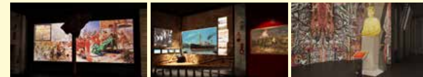
Inside nine basement spaces of Ben Duoc Temple

Nine spaces of Ben Duoc Temple are showrooms to introduce typical revolutionary movement events, typical characters in the struggle indomitable tenacity of Saigon - Cho Lon - Gia Dinh people, vividly representing monumental paintings, statues, mock-up, art forms, sculptures combined with sound and light, etc.