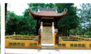
MODEL OF ONE PILLAR PAGODA (9/10 Scale)