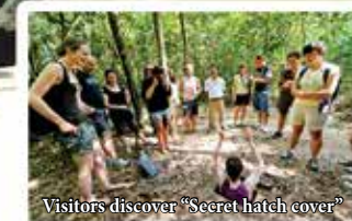
Visitors discover "Secret hatch cover"

Ben Dinh Tunnel is a revolutionary historical relic, a leader base of Cu Chi District Party Committee in the war against the US, a place of accommodation, meeting and also a unique battle position, contributing to the victory of fight against the enemy to save the country. After Dong Khoi Movement, in 1967 the movement of digging tunnels in Cu Chi was gradually improved and strongly developed in the whole district, especially in 06 northern communes. There is also a system of interlacing combat trenches with a tunnel leading to Dong Du Base (25th Division of the United States nicknamed "Tropical Lightning" stationed) and more interestingly, visitors will see the carcass of M41 Tank of the US troops stuck with guerrillas' mines in 1970, lying in the middle of the woods. This is a testament to the failure of the US army on Cu Chi battlefield when they faced an invisible army underground.