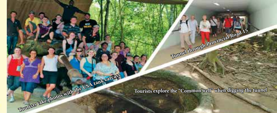
Tourists take photos with the USA tank carcass