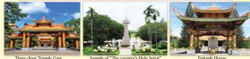
Three-door Temple Gate