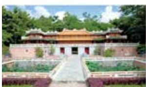
MODEL OF NGO MON - HUE (1/4 Scale)