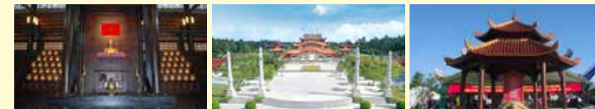
Inside main temple

The revolutionary traditional area of Sai Gon - Cho Lon - Gia Dinh was built on February 18, 2010, with a total area of 13.5 hectares including the following items: Temple of the leaders with great merits in the revolutionary fighting of Saigon - Cho Lon - Gia Dinh; epitaph house; lotus lake; typical landscape areas of Southeast and Southwest areas; historical gallery, etc.