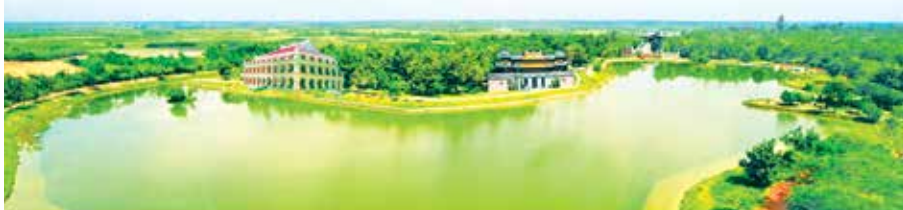
Landscape lake simulating Vietnam's East Sea

In 2002, Cu Chi Tunnels Historical Monuments started planting precious wood forests from 3 regions of North, Central and South of Vietnam in the shape of Vietnam map, then built a landscape lake simulating Vietnam's East Sea and West Sea along the S-shaped forest, with an area of 6.8 hectares. Until 2008, built 3 typical models of 3 regions such as: Chua Mot Cot (One Pillar Pagoda), Ngo Mon Hue, Dragon Wharf. Coming here, tourists both visit the architectural models of Vietnam's famous cultural characteristics, while having the experience in rewarding nature.